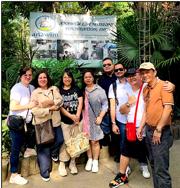
Thank you, Clearing Officers Club Inc. (COCI)!