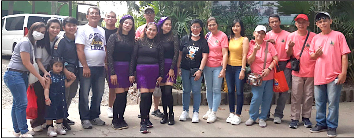
Thank you, Doña Aurora High School Section 3 Pine!