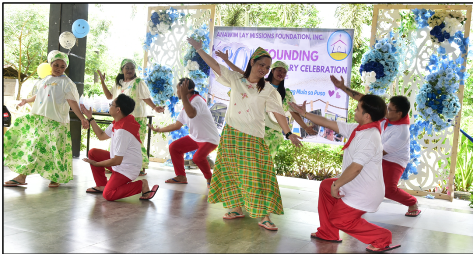
Tiklos Folk Dance, presented by selected staff, symbol of our service cooperation.

We start with a dance that mirrors our bayanihan culture, so valuable for us Filipinos and particularly, our Anawim Family.