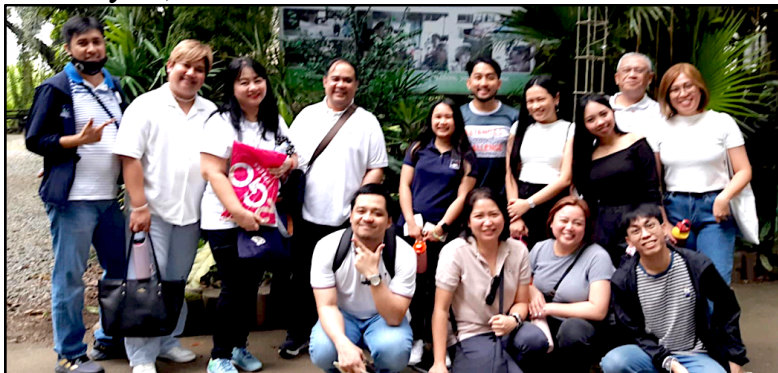
Thank you, AXA Phils!