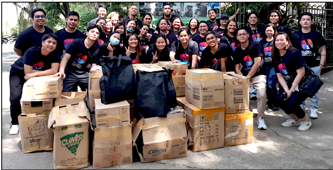
Thank you, Nice Incontact Philippines, Inc.!