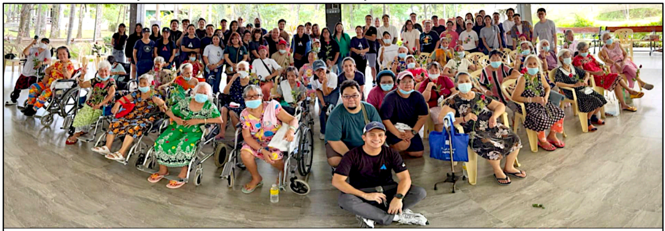
Thank you, Atlasian Philippines!