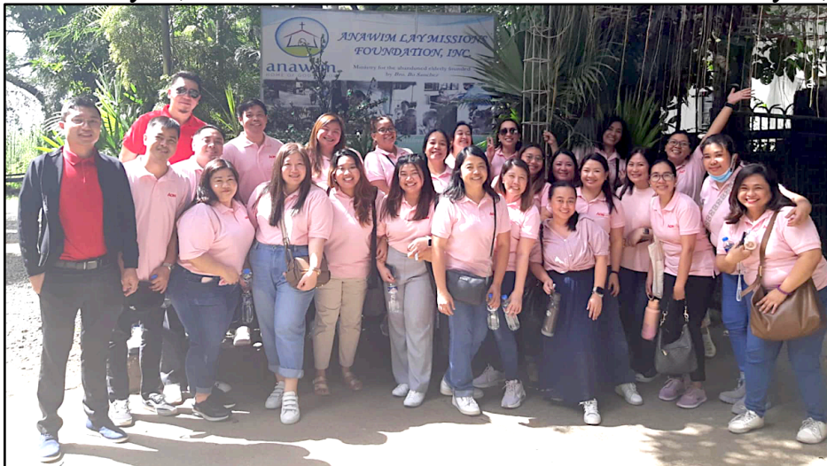
Thank you, Aon Insurance & Reinsurance Brokers Phils.Inc.!