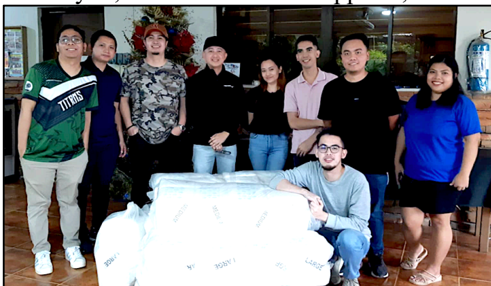
Thank you, Opentext Philippines Inc!