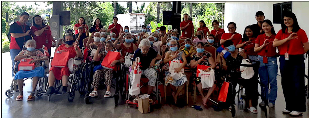
Thank you, China Banking Corp!