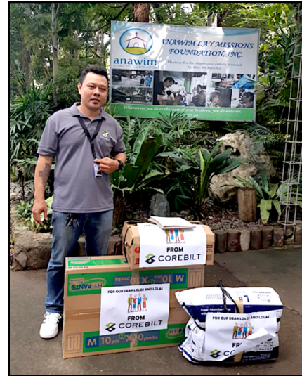
Thank you, Corebilt PH!