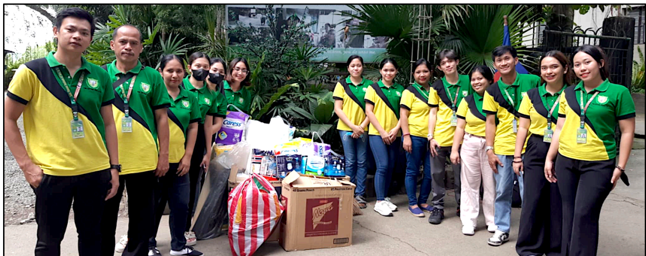
Thank you, Saint Vincent Institute of Arts and Sciences!