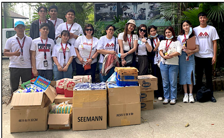
Thank you, AMA Comp College Fairview!