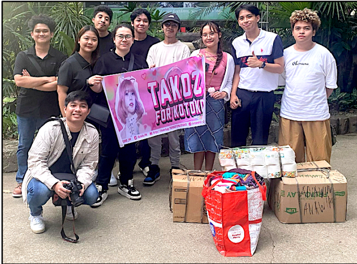
Thank you, Kotoko PH!