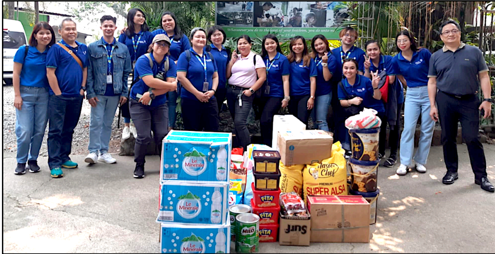
Thank you, Johnson Controls!