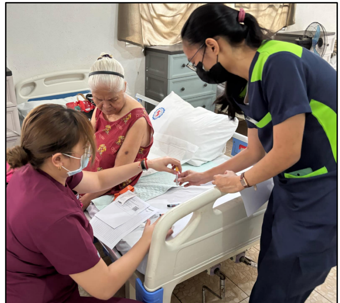
Thank you, Medical Team of TeleCure for free health check-up of our Lolos and Lolas and Anawim Staff