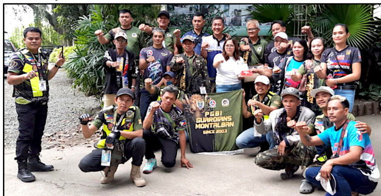
Thank you, Philippine Guardians Brotherhood, Inc.!