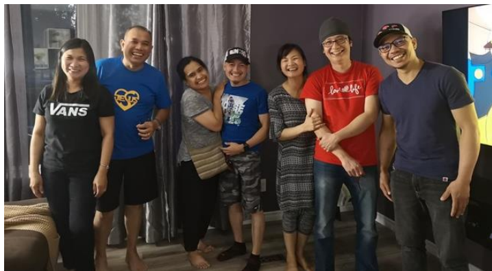
Special visit from Edmonton to Brandon