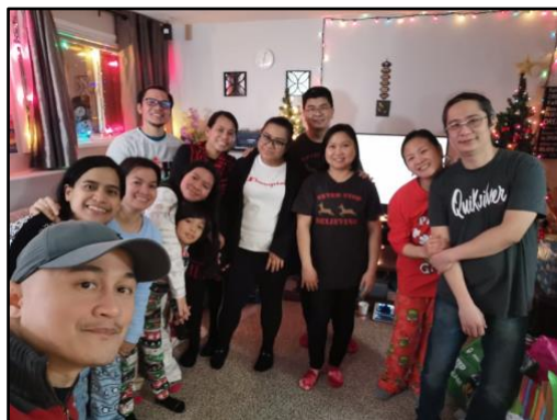
Christmas Party 2021