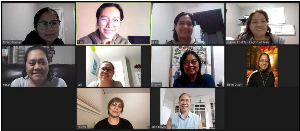
Intercessory Ministry with Feast Winnipeg, Feast Light Neepawa, and Feast Light Brandon