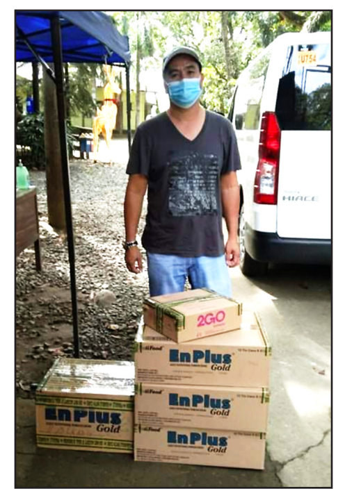
Thank you, Belikenz Pharma!