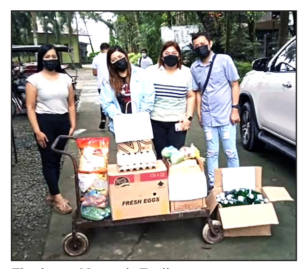
Thank you, Novannie Trading