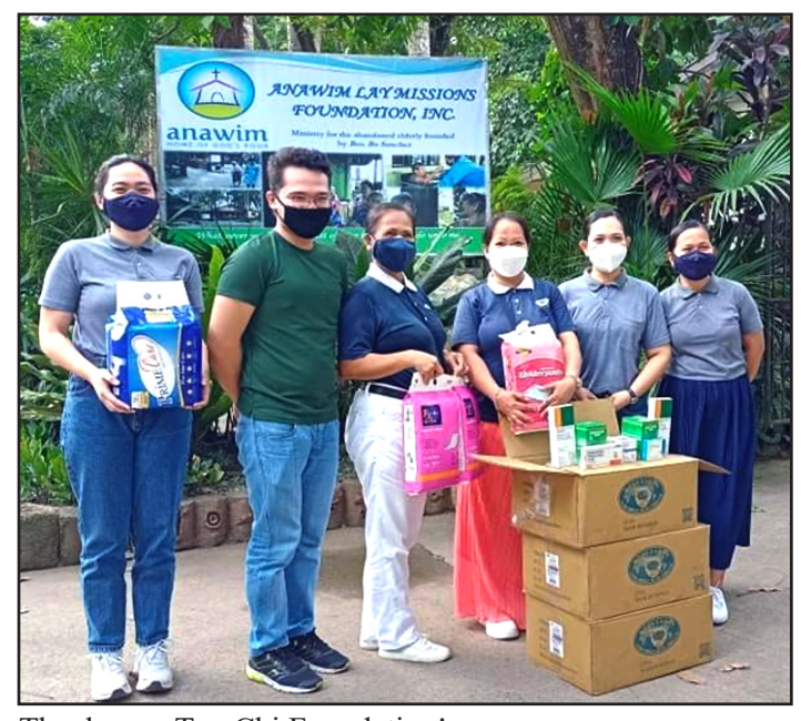
Thank you, Tzu Chi Foundation!