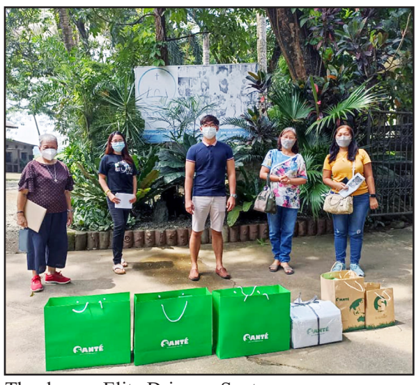
Thank you, Elite Driven - Sante Barley International