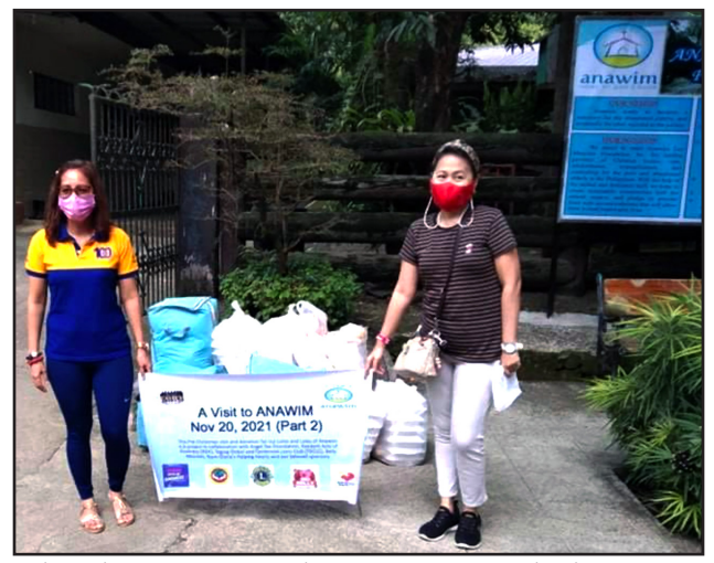
Thank you, Angel Y. Tan Foundation!