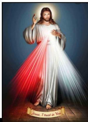
DIVINE MERCY SUNDAY