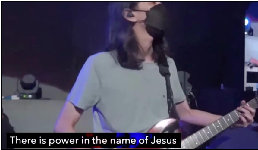
There is power in the name of Jesus