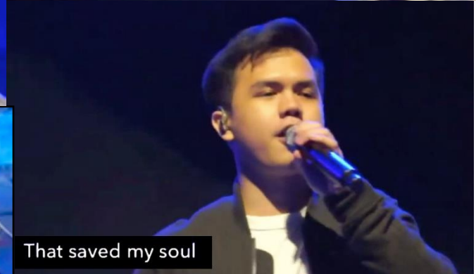
That saved my soul