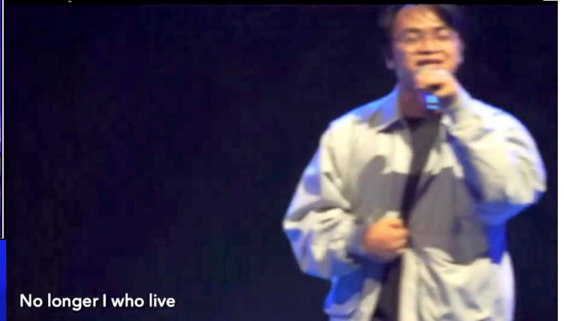
No longer I who live