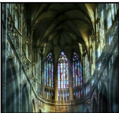
SECOND SUNDAY OF EASTER