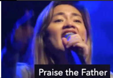
Praise the Father