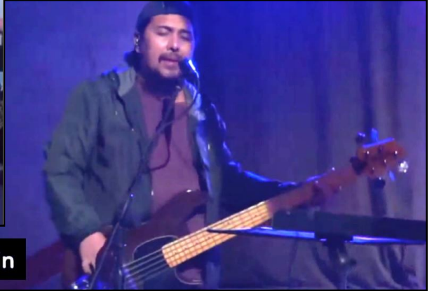
To break every chain