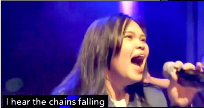
I hear the chains falling