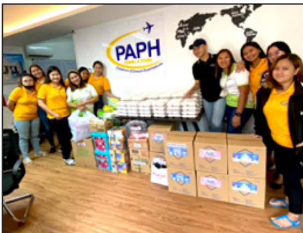
Thank you, PAPH Travel and Tours!