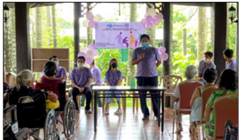
Thank you, Primesearch Service Provider!